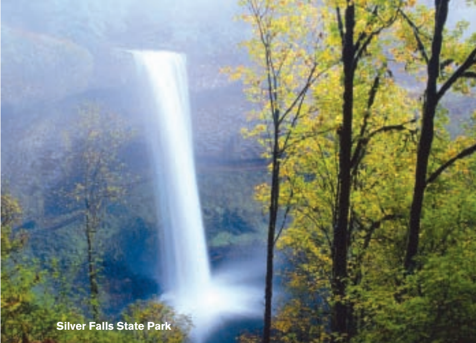
Silver Falls State Park