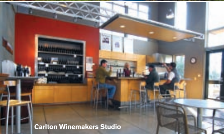
Carlton Winemakers Studio