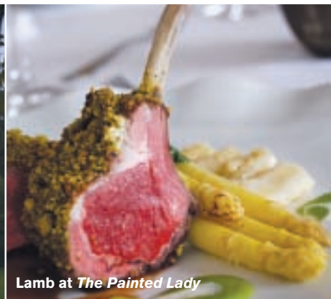
Lamb at The Painted Lady