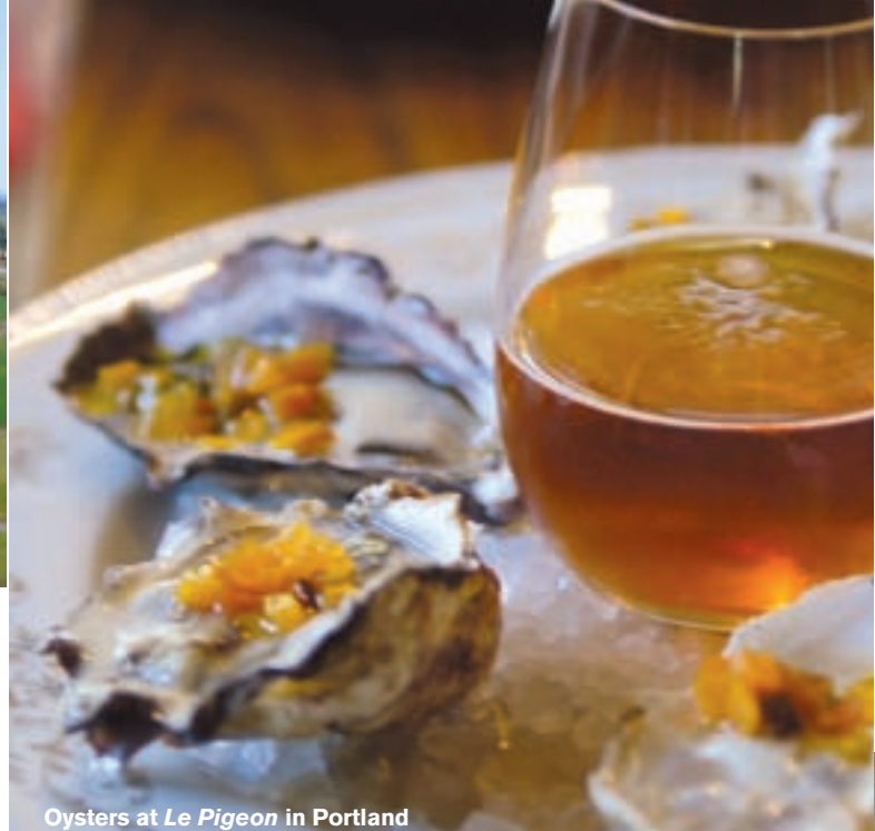
Oysters at Le Pigeon in Portland